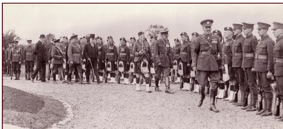
Consecration Day on 21 September 1930 — Review of the Guard of Honour

Beginning in 1910, the vast majority of LPF burials in Québec took place in the plots the Fund had purchased in Mount Royal's two cemeteries. But these were nearly filled in the late 1920s. The LPF Québec Board of Directors then decided to purchase land to provide the organization with its own cemetery, a choice mainly motivated by rising burial costs on Mount Royal. The ideal location was found in Pointe-Claire about 22 km west of downtown Montreal.